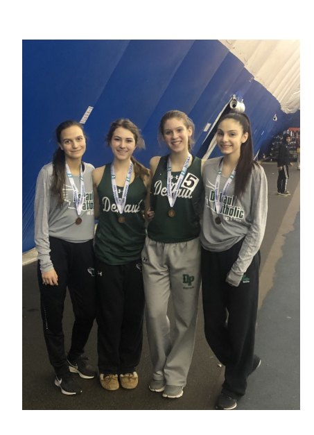
<u>Click Here For State Championship</u> <u>Relay Updates.</u>