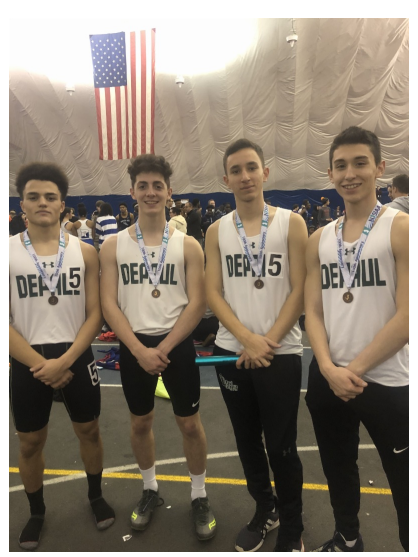
<u>Click Here For Conference</u> <u>Championship Updates.</u>